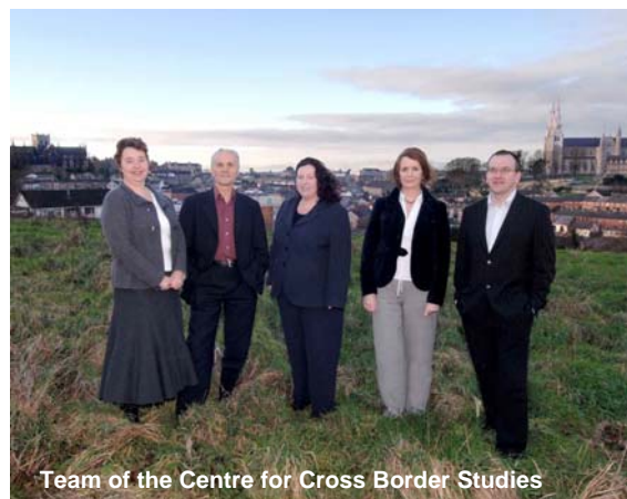
Team of the Centre for Cross Border Studies

In the past nine years the Centre for Cross Border Studies has worked hard to support increased inter-governmental cross-border cooperation by providing complementary research, development, training and ICT services. It has carried out cross-border