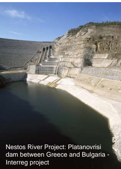
Nestos River Project: Platanovrisi dam between Greece and Bulgaria - Interreg project