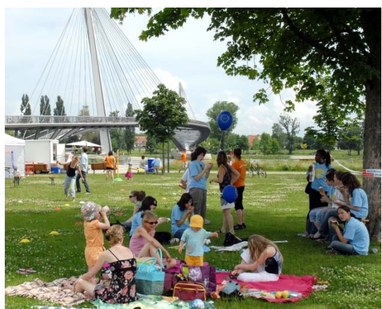
European picnic in the "Jardin des Deux-Rives" between Strasbourg and Kehl

Therefore, the objective of the EGTC project is to analyze the development of the cross-border conurbations, in order to identify best practices and define « governance models ». These models could be developed in the new Member States. The project also aims to study how the European grouping of territorial cooperation (EGTC) could become a European tool of reference to support governance of cross-border agglomerations.