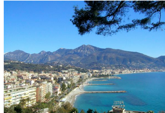
The French-Italian Riviera, a sea-coast worth preserving

As part of an Interreg IVA Alcotra project, on 14 October 2010 the Communauté d'Agglomération de la Riviera Française and six French and Italian municipalities (Menton, Roquebrune-Cap Martin, Bordighera, Camporosso, Vallecrosia and Ventimiglia) signed two agreements on "prevention and control of marine pollution", covering on the one hand coordination of the human and material resources of the partners in the event of pollution (mutual alert, joint training, loans of equipment and human resources, etc.) and on the other hand joint placement of the contracts necessary for implementation of the project. This type of local cooperation complements the existing agreements between the states to combat pollution at sea, such as the RAMOGE agreement between France, Italy and Monaco.