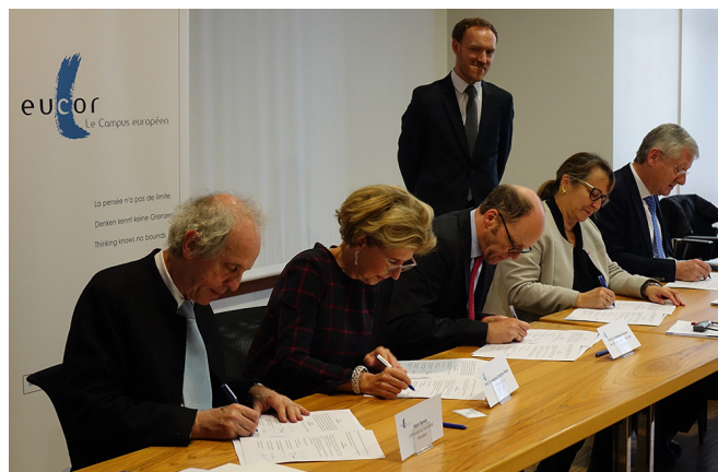
The chancellors of the Eucor universities – The European Campus

The first European Grouping of Territorial Cooperation (EGTC) to be set up by an alliance of universities is located in the Upper Rhine area. In December 2015, the Universities of Basle, Freiburg, Upper Alsace and Strasbourg, together with the Karlsruhe Institute of Technology, signed the documents establishing "Eucor – The European Campus", a trinational European campus.