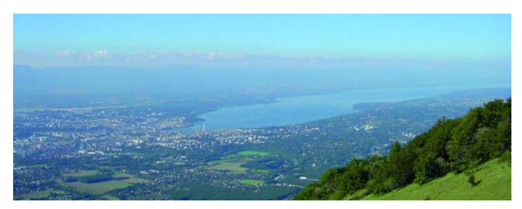
The France-Vaud-Geneva conurbation extends over 2000 sq. km, has a population of 860,694 and provides 403,341 jobs.

Signed in December 2007, a Charter of Commitment has given practical form to the "firstgeneration" France-Vaud-Geneva conurbation project thanks to close collaboration between the Swiss and French partners. Meeting in Archamps on 17 March, its steering committee drew up a balance sheet of work in progress. Territorial rebalancing with regard to housing and economic activities either side of the border is one of the principal issues, at a time when the France-Vaud-Geneva conurbation is facing a demographic