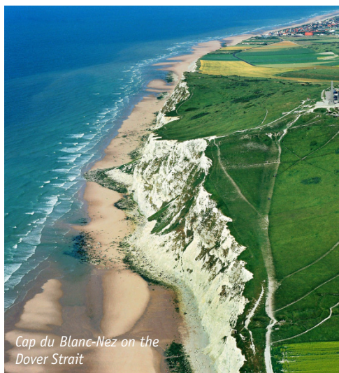
Cap du Blanc-Nez on the Dover Strait

Because straits, at once links between two seas and borders between two territories, are specific spaces, the Pas-de-Calais department council and Kent County Council launched the European Straits Initiative. This partnership, formalised on 23 November 2010 by the signature of a memorandum of understanding bringing together the local authorities on the shores of eight straits in Europe, has a dual aim: gaining recognition of the particular characteristics of straits by the European institutions, and encouraging the development of cooperation projects.