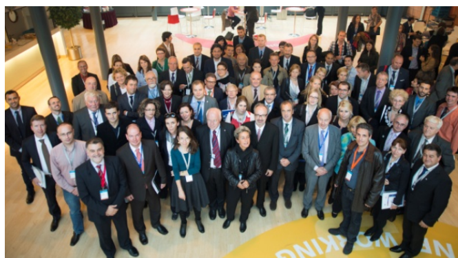
The representatives of the EGTCs in Europe

representatives of the European EGTCs was taken on this occasion.